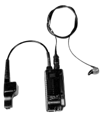
BDN6641A Shown with Interface Module

BDN6641A Ear Microphone for High Noise Levels (up to 105dB), grey