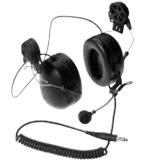
RMN4051B Two-Way Hardhat Mount Headset, black

Ideal for two-way communication in high-noise environments; mounts easily to hardhats with slots, excellent noise reduction of 22dB. Easily replaceable earseals are filled with liquid and foam combination to provide excellent sealing and comfort. 3-foot curly cord assembly. Requires separate in-line PTT adapter cable RKN4095A. Hardhat not included.